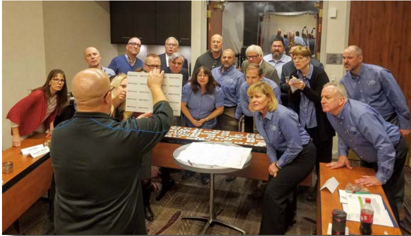
The 2019 - 2020 NHA Board of Directors and staff participating in a retreat to determine the strategic direction of the Association.

The NHA tackles communications daily and works on special projects throughout the year that are of interest to NHA members and benefit the broader health care community. We also research and identify national best practices that can be applied at state and regional levels.