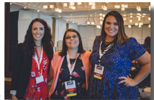
Team members from Nevada Donor Network at the 2019 NHA Annual Meeting.

Collective Medical Comagine Health Desert Radiology Donor Network West Global Medical Response HospitalCareers Lancaster Pollard Las Vegas Heals MedX AirOne Nevada Donor Network Nevada System of Higher Education SilverSummit Healthplan