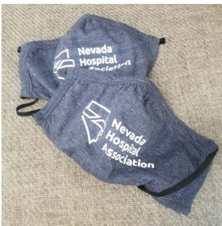
Nevada Hospital Association face masks that were provided to HealthPAC contributors.