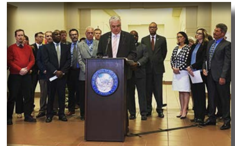
The Nevada Hospital Association and two key members were invited to participate with Governor Sisolak's expert discussion around COVID-19 in February 2020.